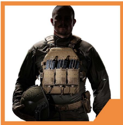
CARRYING SYSTEM BODY ARMOUR