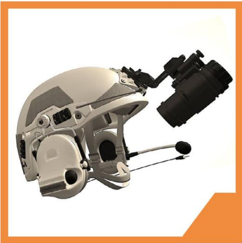
HYBRID BALLISTIC HELMET