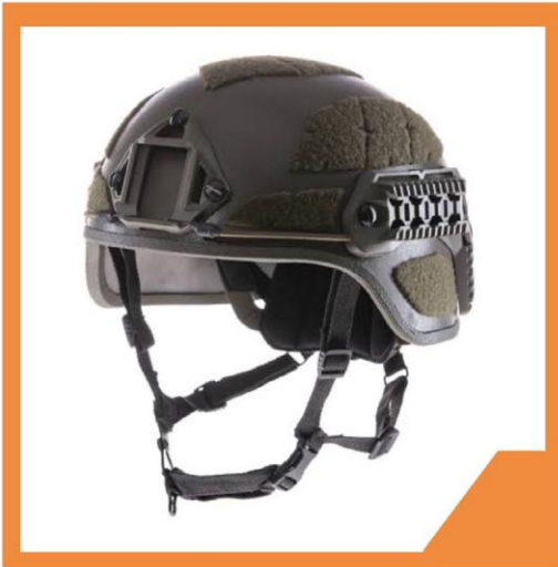
CORE BALLISTIC HELMET