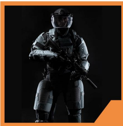
EXO SKELETON FULL BODY ARMOUR